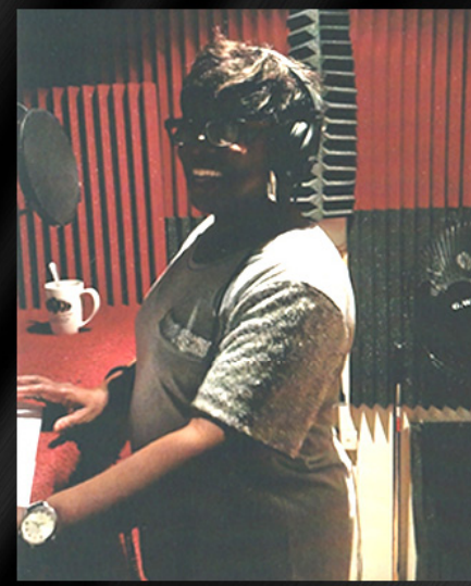
In the Studio